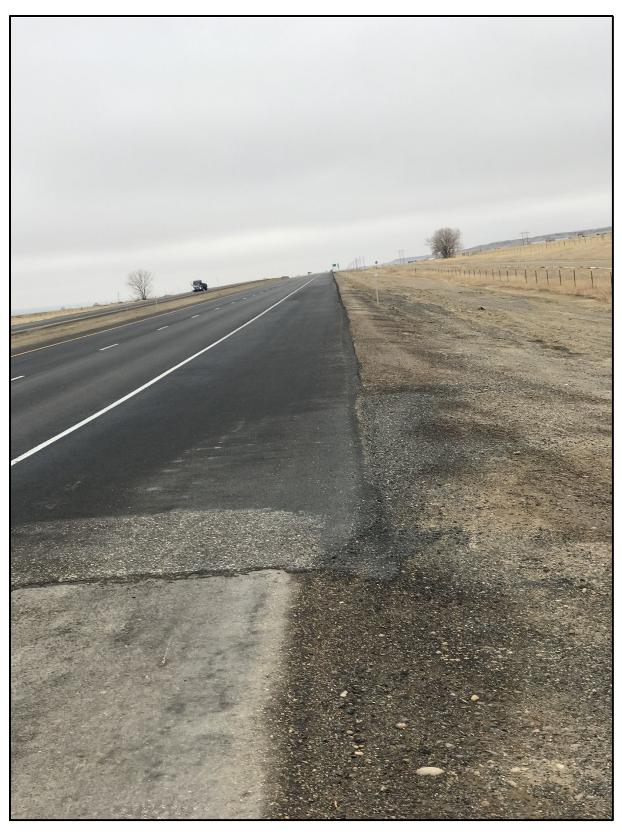
\spadesuit RP 199.20, view west. Westbound shoulder, east end of the project, test section.