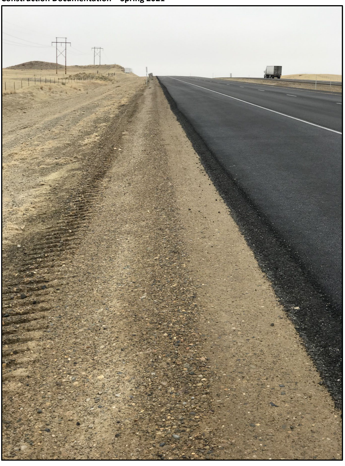
↑ RP 192.60, view east. Westbound shoulder, west end of the project, test section.