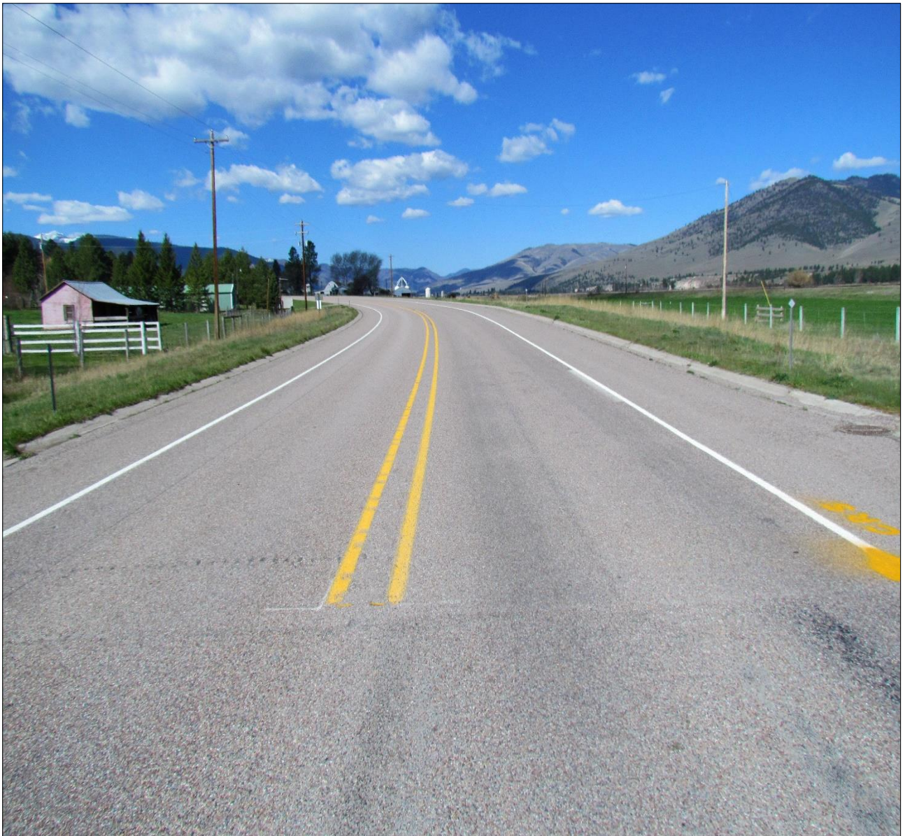
↑ CRS-2P: End of project, Township of Dixon; view west.