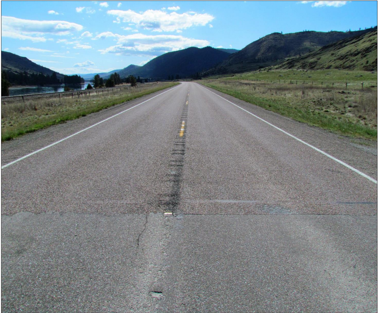
↑ Section CRS-2P : Approximate project length RP 98.7-108.5; Project start at west end on Primary HWY 200; view east.