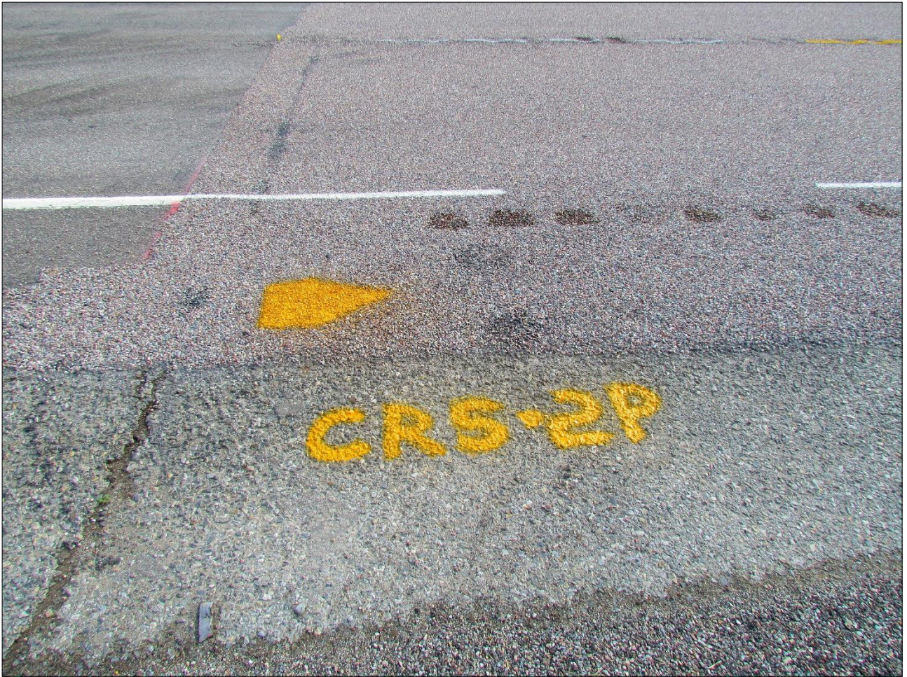
↑ Example of how sections are marked in the field.