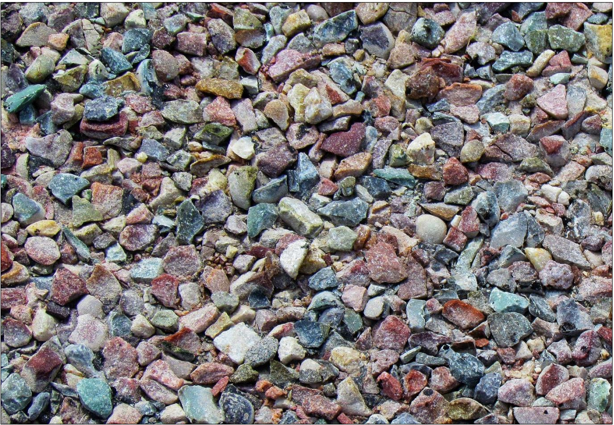
↑ Close-up of CRS-2P chip seal after sweeping.