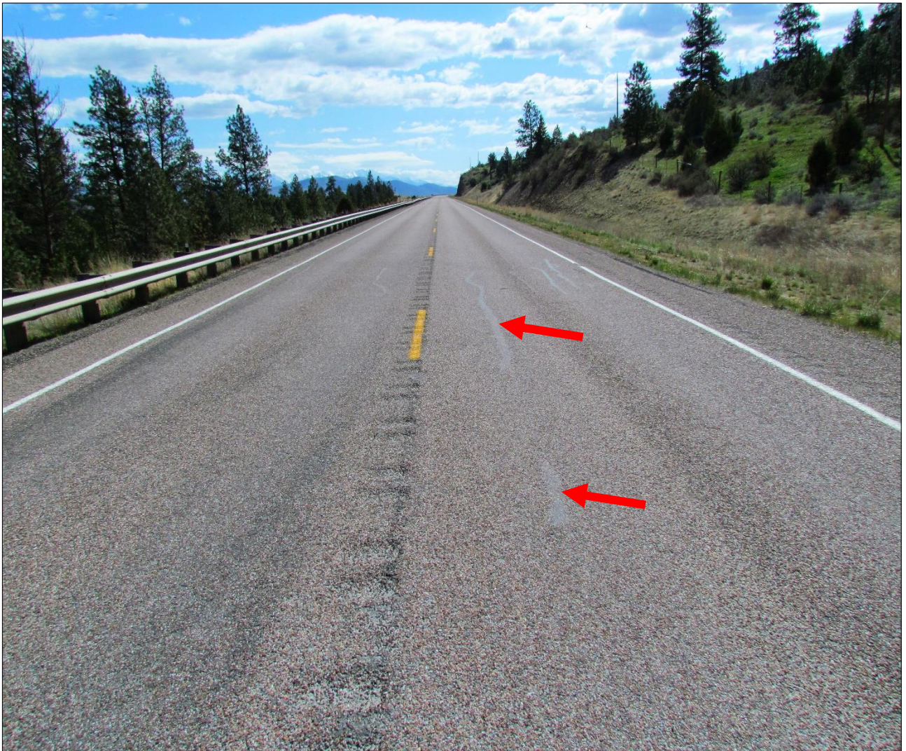
↑ Section CRS-2P : Approximate RP 103; view east: Areas denoted by the red arrows point to where (at least visually) the seal and cover has lost adhesion to previous crack sealing.