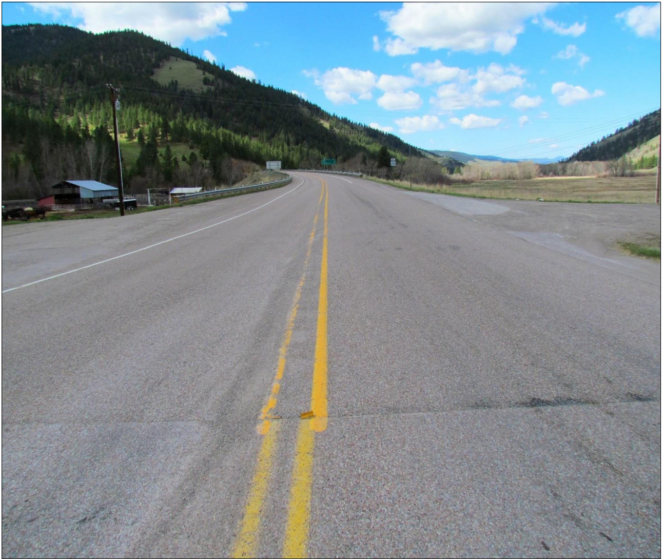
↑ CHFRS-2P: End of project, junction of P-200 & NHS/NI-93, ; view west.