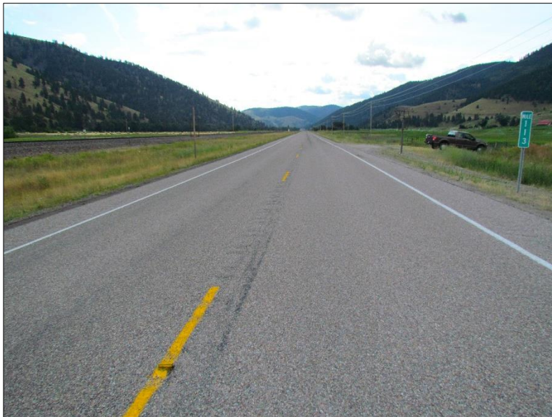
← Completed chip seal – Dixon/Ravalli CHFRS-2P near reference post 113 (view east).