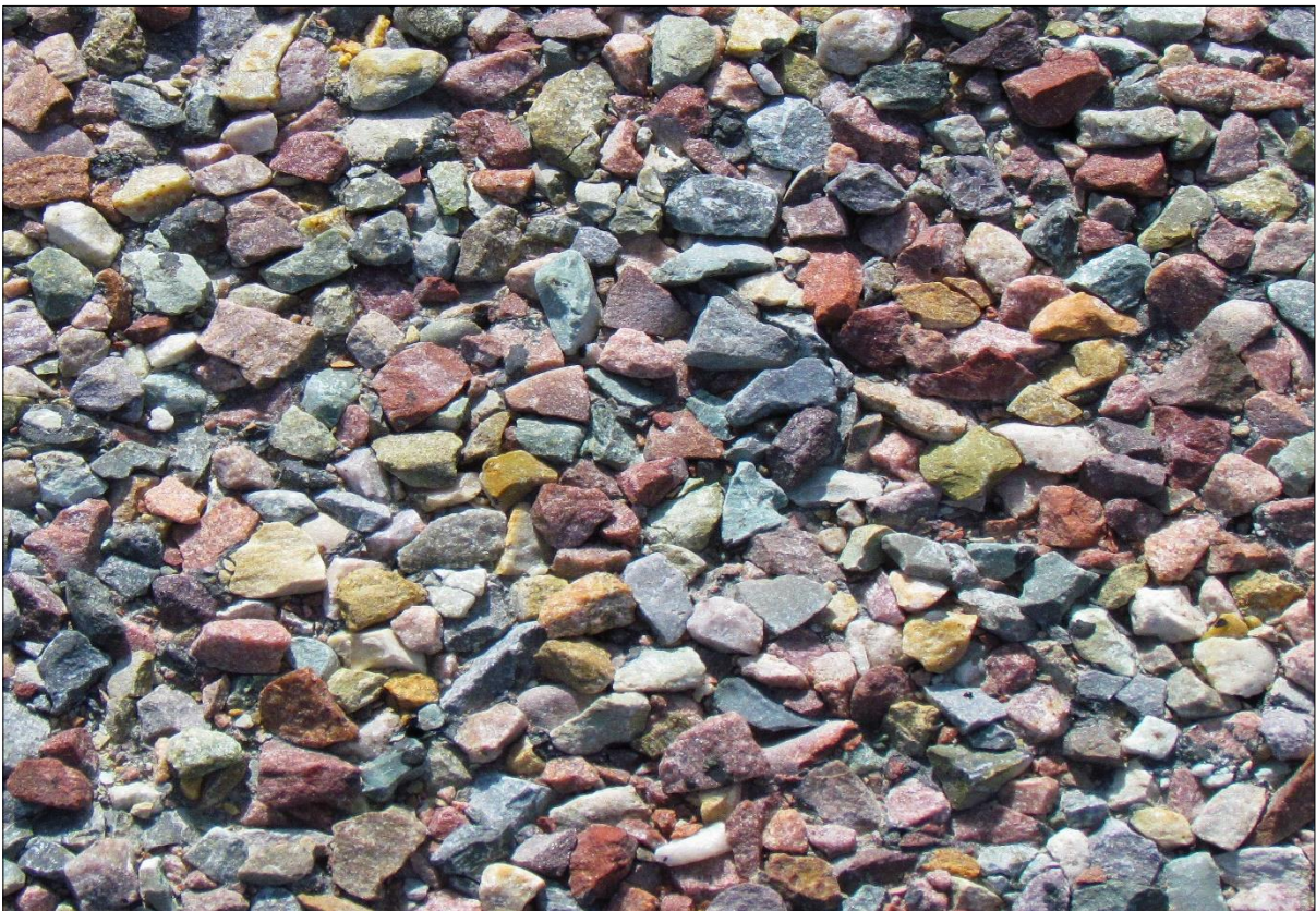
↓ Close-up of CHFRS-2P chip seal after sweeping.