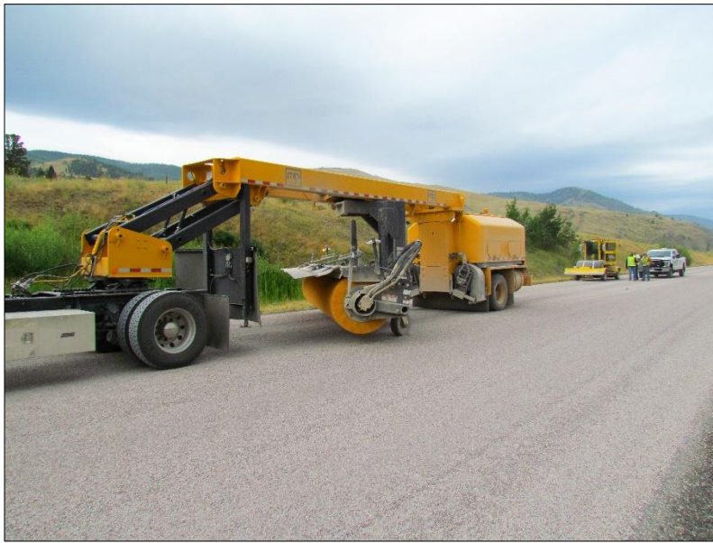
← Several aggregates sweepers were used on the projects.