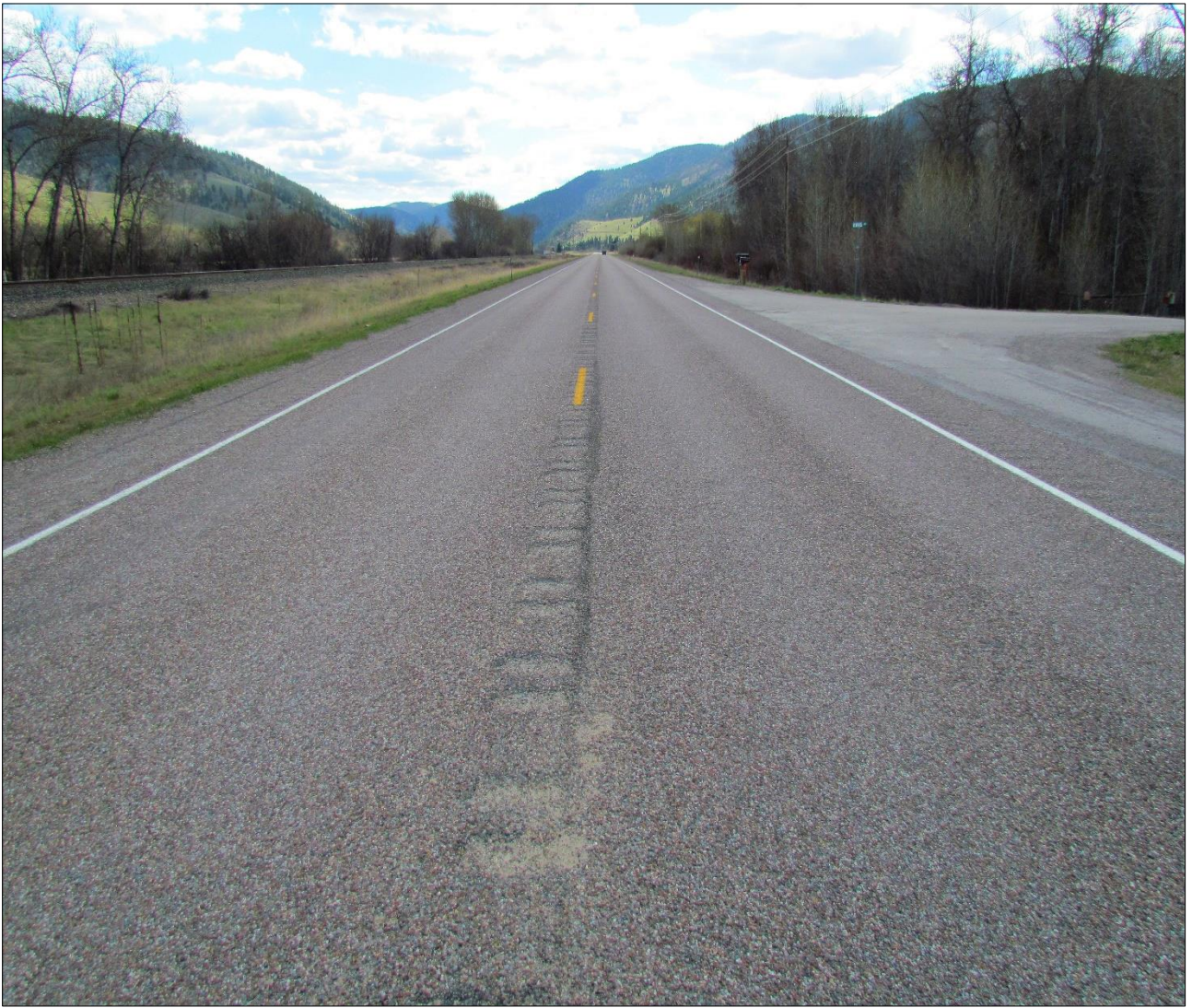
↑ Section CHFRS-2P : Approximate RP 112; view east.