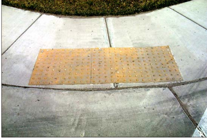
Installation 7: Located on the northwest corner of the intersection of 3 rd Ave. N. W. and 6 th St. N. W.

This treatment is failing rapidly. The surface of the mat has continued to rip and tear. There is additional dome loss since the pre-winter evaluation. Edges are losing adhesion. Color is fair. At this time it is not a trip hazard.