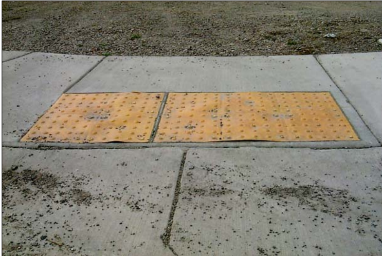
Installation 2: Located on the southwest corner at the intersection of 6 th Ave. N. W. and 6 th St. N. W.

This treatment performed poorly since construction. Approximately 35% of dome relief has been lost through use of a shovel or blade apparatus during the 2004-05 winter. Domes are wearing rapidly. The edges within the treatment and perimeter are beginning to lose adhesion. The tactile response is spongy, substantial air pockets beneath the mat, severe loss of adhesion. The setting pins are breaking off. Color is good. This treatment has been determined as a trip hazard and has been asked to be removed. Note that this device was improperly installed and most likely led to its premature failure.