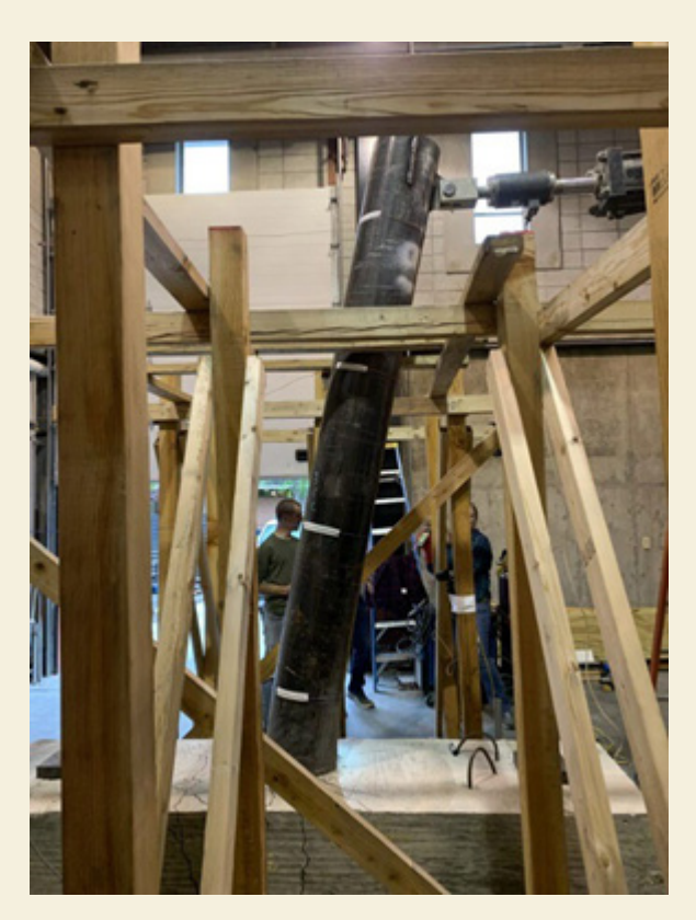
Figure 4: Final specimen being tested.