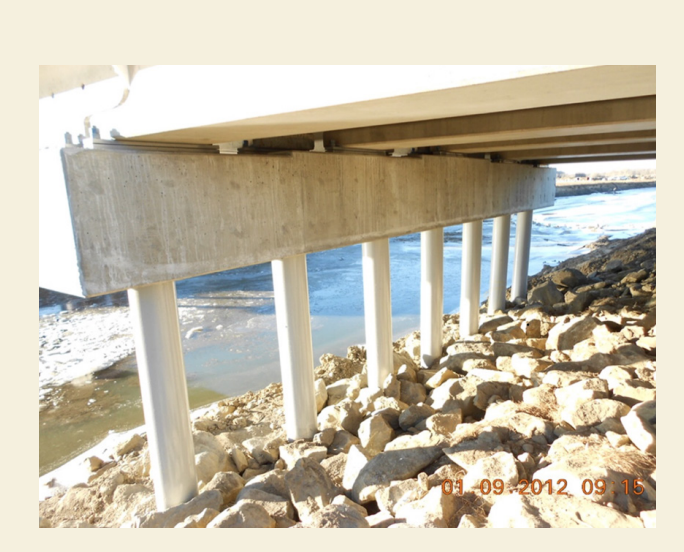
Figure 1: Typical MDT concrete-filled steel pile and concrete pile cap bridge substructure support system.

The primary objectives of this research were to (a) further validate/ improve MDT's CFST to concrete pile cap connection design/analysis methodologies, (b) ensure the efficacy of these methodologies for a wide variety of potential design configurations, (c) gain further insights on the basic connection behavior under extreme lateral loads, and (d) determine possible improvements in the design methodology.