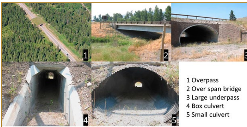
Figure 1: The five types of wildlife crossing structures along US 93 North.

In addition, the researchers investigated the effectiveness of wildlife guards at access roads, wildlife use of jump-outs, and the functioning of a human access point (Figure 2). Wildlife guards are similar to cattle guards and are intended to keep wildlife,