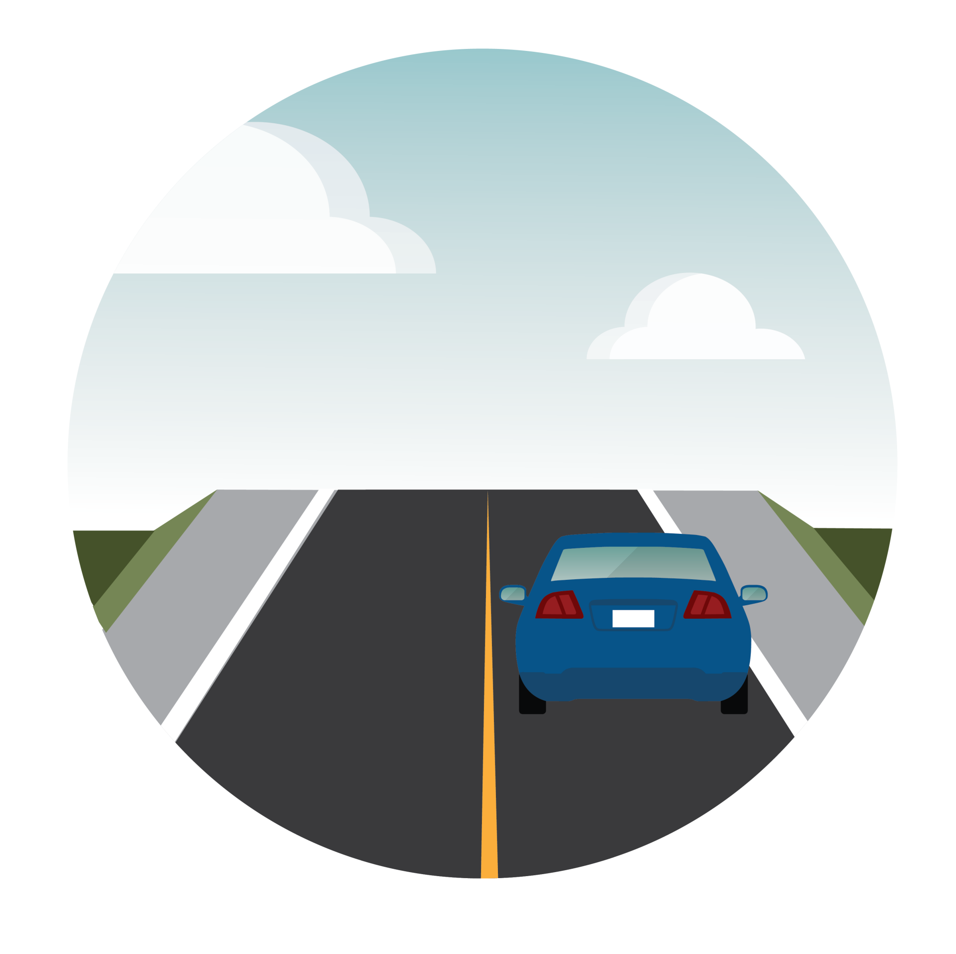
Side slope flattening for improved roadside recovery