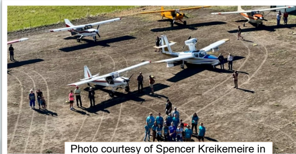
Photo courtesy of Spencer Kreikemeire in Brandon Wilson's R-44 helicopter

Please RSVP if you plan on flying in at mdtad@mt.gov or 406-444-2506.