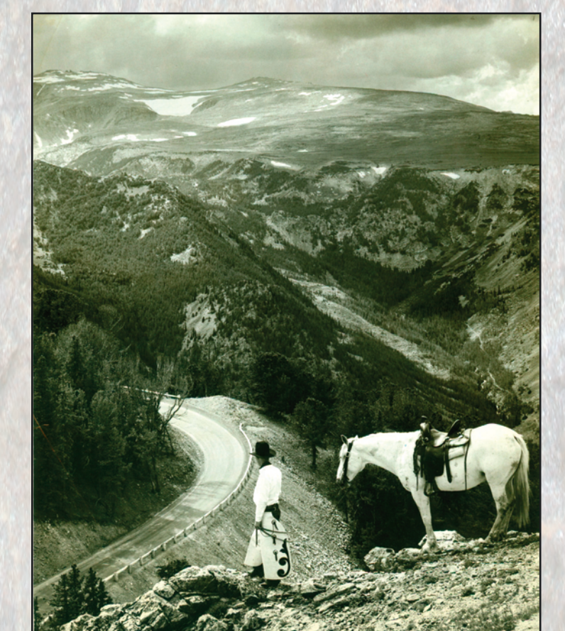
Cowboy's View Carbon County Historical Society Collection. (courtesy Northern Pacific Railway, F.W. Byerly, photographer)

motorists an excellent opportunity to experience one of the few North American highways reaching such spectacular high-elevation alpine scenery.