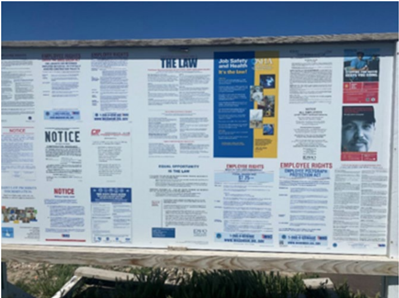
Required notices and posters are printed on MDO which is framed and mounted on posts.