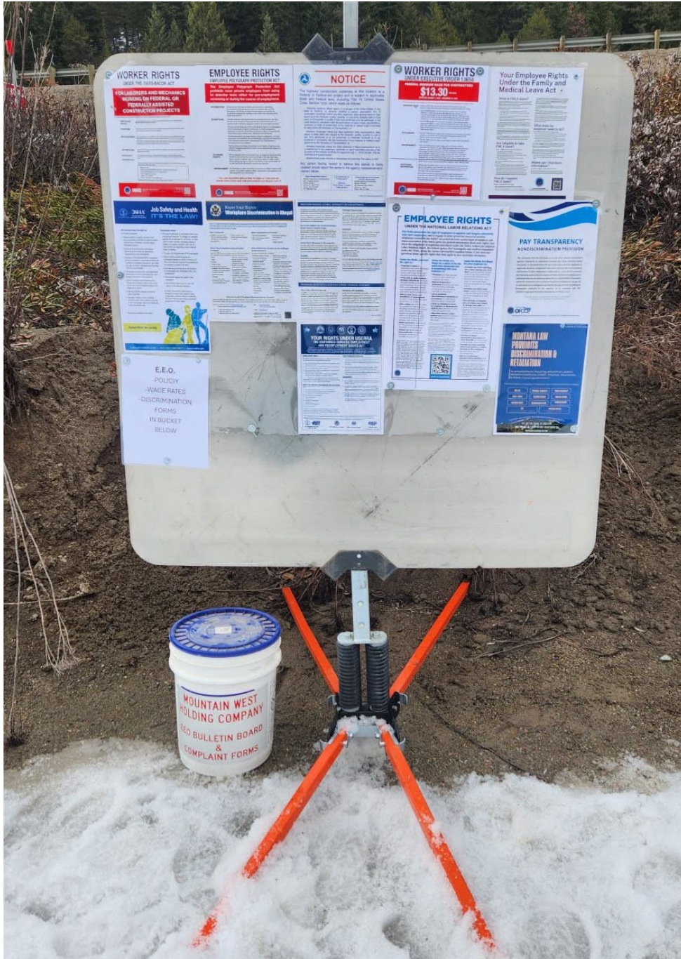
Required notices and posters are on the whiteboard, held by a wind jammer. Wage rates and EEO Policy Statements are in the bucket.