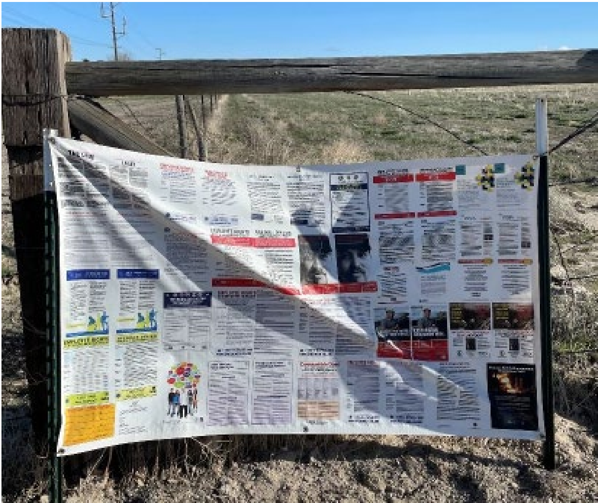
Required notices and posters are printed on banner material and posted to metal fence posts. Notices are provided in two languages.