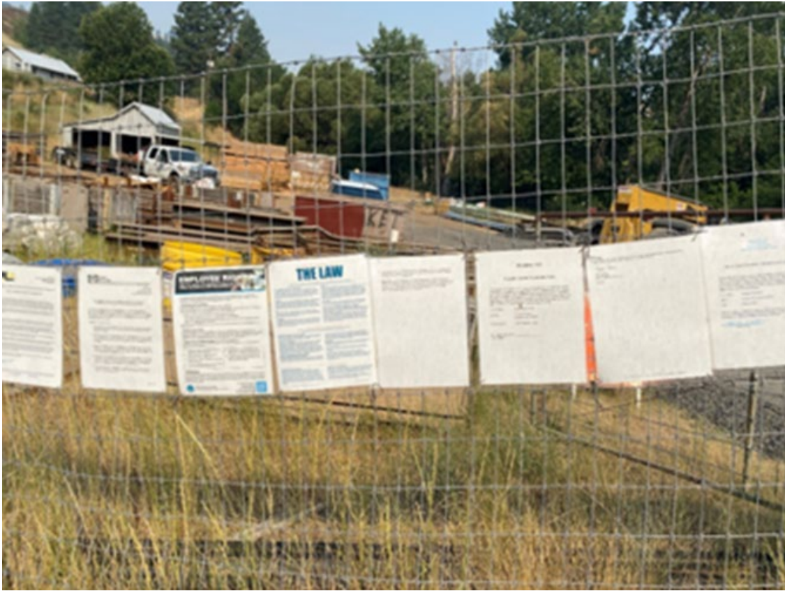
Required notices and posters are laminated and affixed to a fence with zip ties.