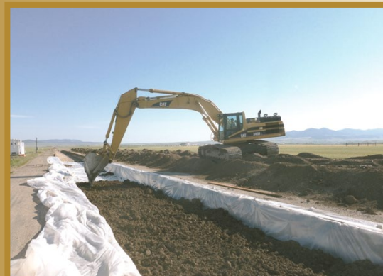
Filling lined trench with subgrade